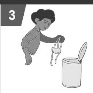
Replace the mask with a new one as soon as it is damp and do not reuse single-use masks

Avoid touching the mask while using it; if you do, clean your hands with alcoholbased hand rub or soap and water