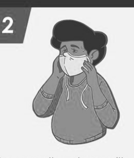
Cover mouth and nose with mask and make sure there are no gaps between your face and the mask

Avoid touching the mask while using it; if you do, clean your hands with alcoholbased hand rub or soap and water