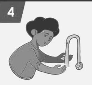
To remove the mask: remove it from behind (do not touch the front of mask); discard immediately in a closed bin; wash hands with alcohol-based hand rub or soap and water