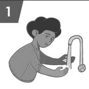
Before putting on a mask, wash hands with alcohol-based hand rub or soap and water